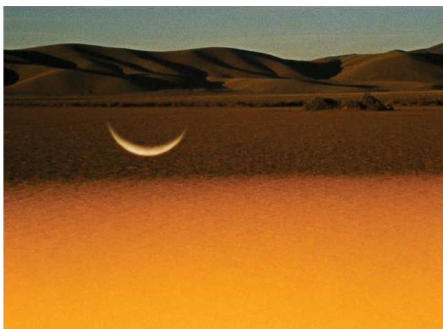
Malena Szlam, Altiplano , video still