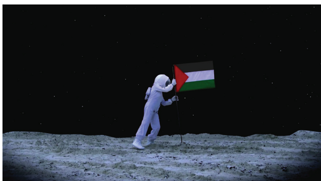
Larissa Sansour, A Space exodus , video still