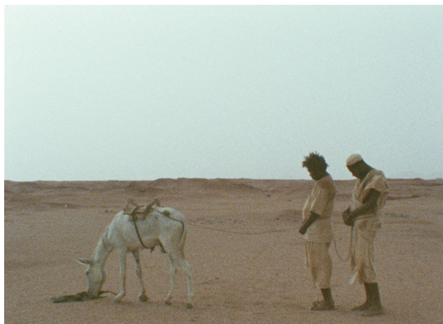
Ibrahim Shaddad, Al Habil / The Rope , video still © Sudanese Film Group, Ibrahim Shaddad